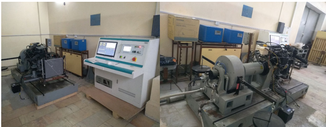
Figure 1. Test bench of the Chevrolet Cobalt engine

By adding additives to fuel, the following effects can be achieved. Experiments were conducted on a Chevrolet Cobalt engine on a laboratory test bench using AI-92 gasoline with the MN-9950 fuel additive to evaluate its impact (Figure 1).